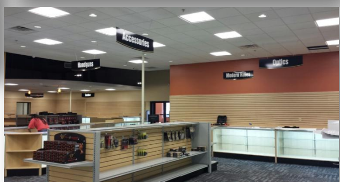
COLONIAL SHOOTING ACADEMY VIRGINIA BEACH, VA 2014