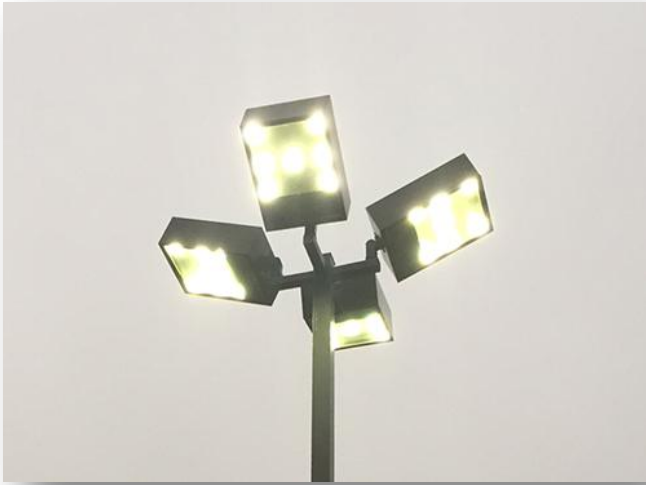
LED Energy Saving